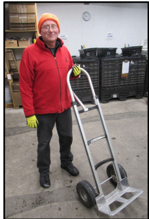
Brian Naylor Bottle Return Depot, RCL Branch 445, Callander

Feel free to drop by the Bottle Return Depot to see these new additions. And while you're visiting, don't forget to bring us your empty alcohol containers!